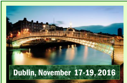
Dublin, November 17-19, 2016