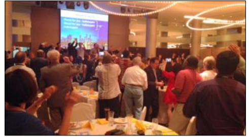
Twenty national groups were represented