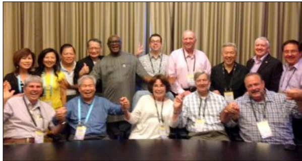
Working together in unity across the nations: the steering group and hosts in Singapore.

The testimonies of how effective they have been was so inspiring: businesses transformed, laws changed (including a new declaration of human rights), a government-backed training course on