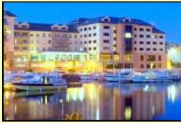
Fellowship and outreach during the 37th All-Ireland Convention at Athlone on the banks of the River Shannon