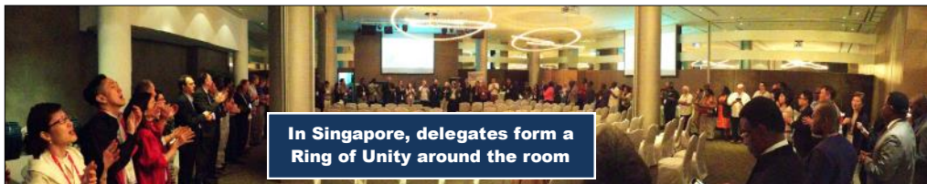
In Singapore, delegates form a Ring of Unity around the room