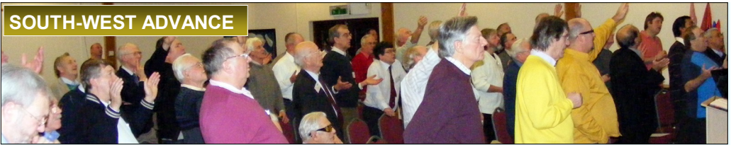
Some of the 70 men who attended the recent South-West Advance at Brunel Manor