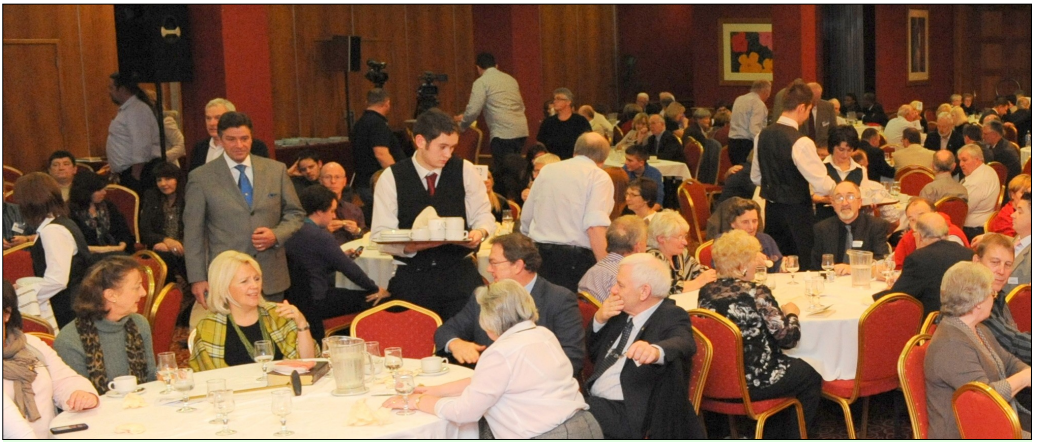
Above: the Saturday night banquet at the Regency Hotel, Dublin.