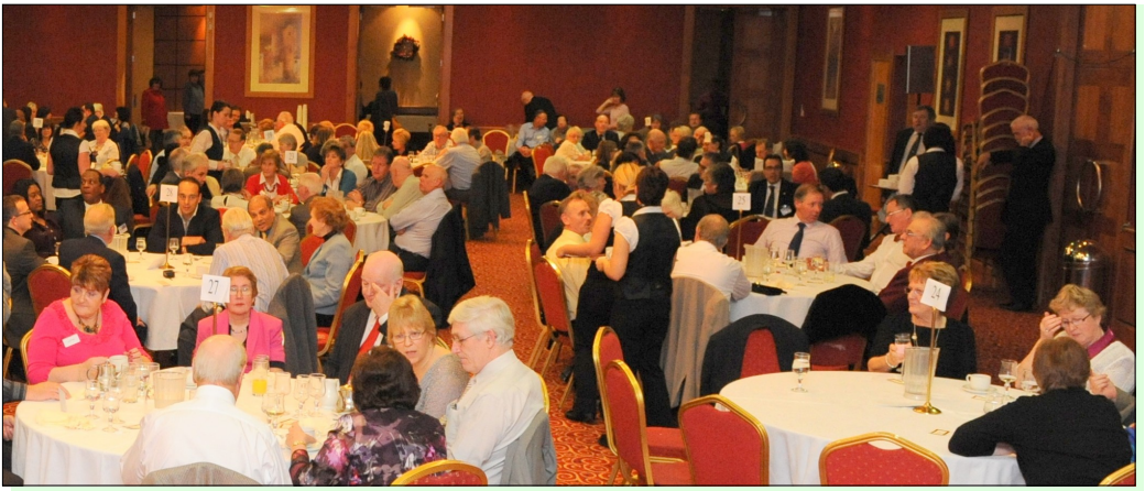
Above: the banquet and, (below), groups of Irish and UK leaders