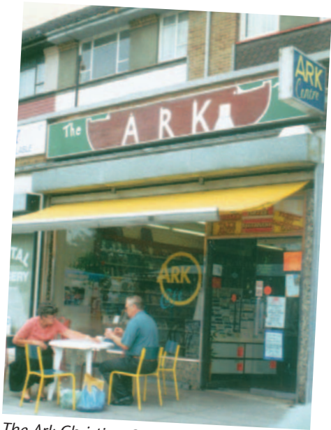
The Ark Christian Centre at Erith.

Still a bachelor, I was burdened to work for the Lord, who had done great things for me. My church group leader said that I would be good running a Christian bookshop. The idea seemed very dull after running a glitzy fashion business. But I sold the business and spent six months telling the Lord that I would do anything other than running a bookshop – until I heard Him say: “Do it for me.” Then, whilst looking for a suitable shop, I met a pastor and Fellowship that had had the vision of just such a shop for eleven years. A shop was bought and The Ark Christian Centre in Erith, Kent was opened. It sold books, music and