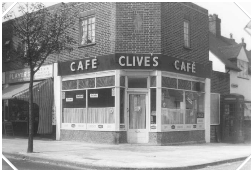
The original café in 1966 in New Eltham.

years – plus one armed hold-up for good measure, seemed to show me that I was surrounded by evil. I had to ‘seek the light’ and I knew that that was in church. I was then invited to an evangelical meeting and the Minister stopped the singing to boldly say: “The Lord says there is someone here He does not want to lose, would they step forward, the Lord wants to bless him.” A voice in my head said: “It’s not you,” and another one said: “It is you, go forward.” I remained in my seat but I was challenged and had a sleepless night. I was made aware of my sins, acutely realising through terrible visions that I was existing without God, but through all this Jesus was calling me.