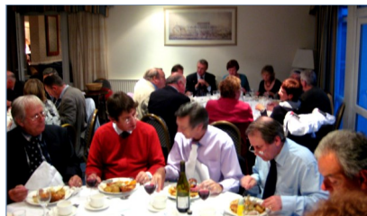
Local gatherings large and small: a way to share fellowship and 'new life stories'

A T our meetings, men from different Christian denominations and various business or employment backgrounds, share how the power of God has transformed their lives in everyday situations. Members include those from all aspects of the marketplace, from the student world to the boardroom . . . from the retired to the unemployed. No-one is excluded.