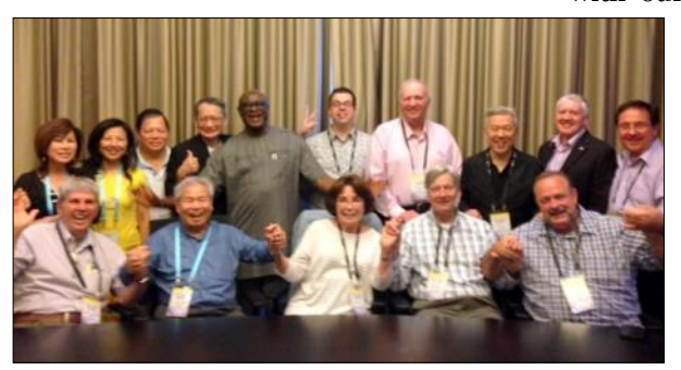
Working together in unity across the nations: the steering group and hosts in Singapore.

The testimonies of how effective they have been was so inspiring: businesses transformed, laws changed (including a new declaration of human rights), a government-backed training course on