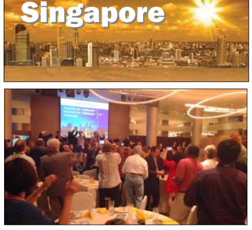
Twenty national groups were represented